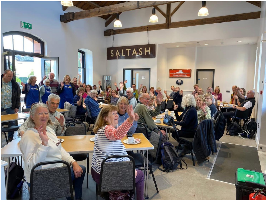
Participants enjoy a well-deserved cream tea at Isambard House