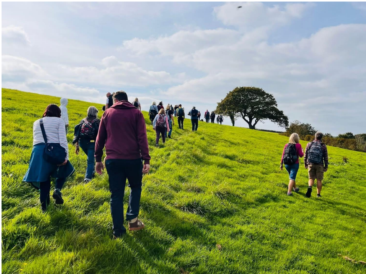
Walkers heading to Pillaton