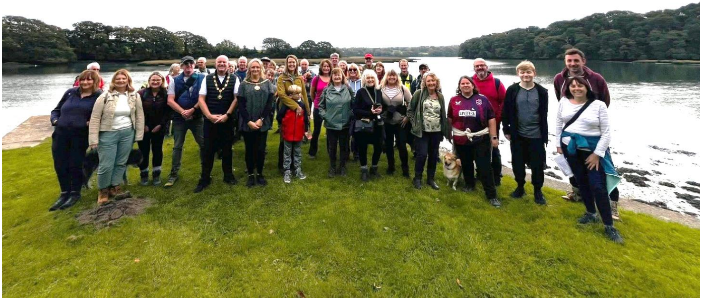
Participants at Moditonham Quay last year