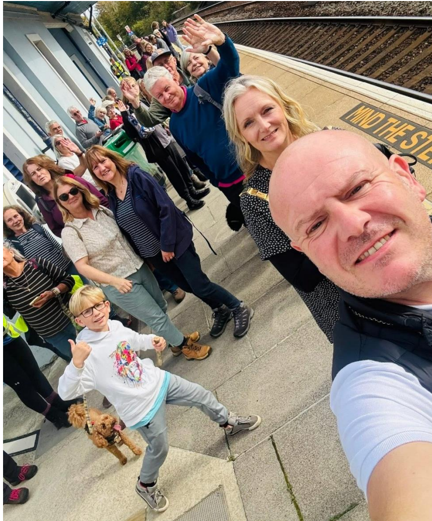
Waiting for the train to Saltash at St Germans