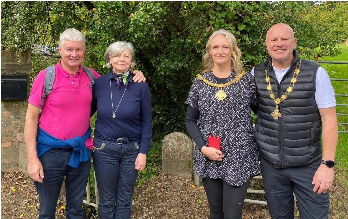
Last year's Beating the Bounds