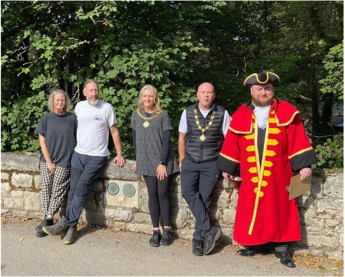
The last stone at Notter Bridge